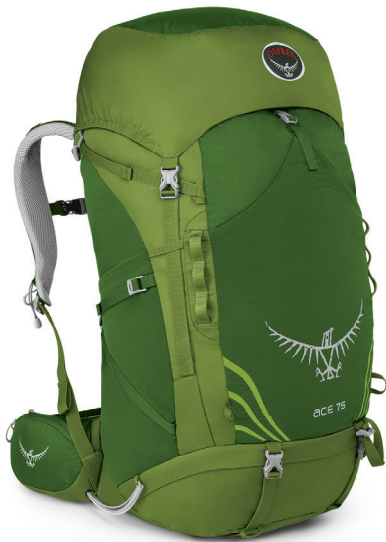
ACE 75 [ages 11-18*]