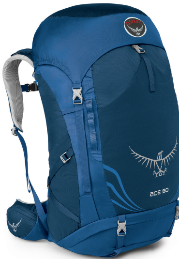
ACE 50 [ages 8-14*]