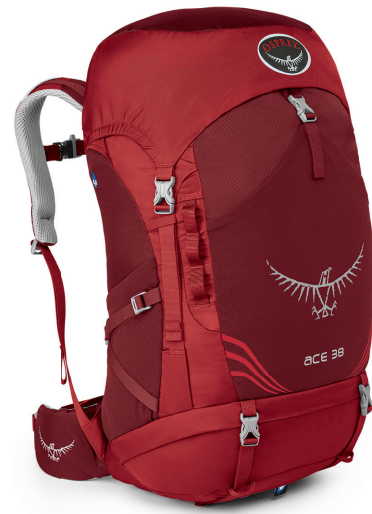
ACE 38 [ages 6-11*]

The Ace Series are technical backpacks for young outdoor enthusiasts ages 10-17 with the same features and fit as Osprey's adult backpacks. An ultra-adjustable torso and hipbelt allows the pack to grow with the user providing years of value and comfort. The Ace 75 provides the capacity and organization required by outdoor education groups.