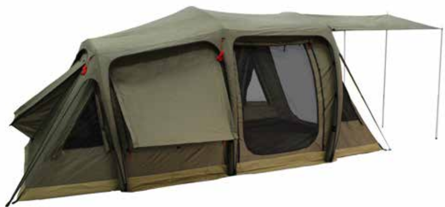
AT-6 model shown on this page