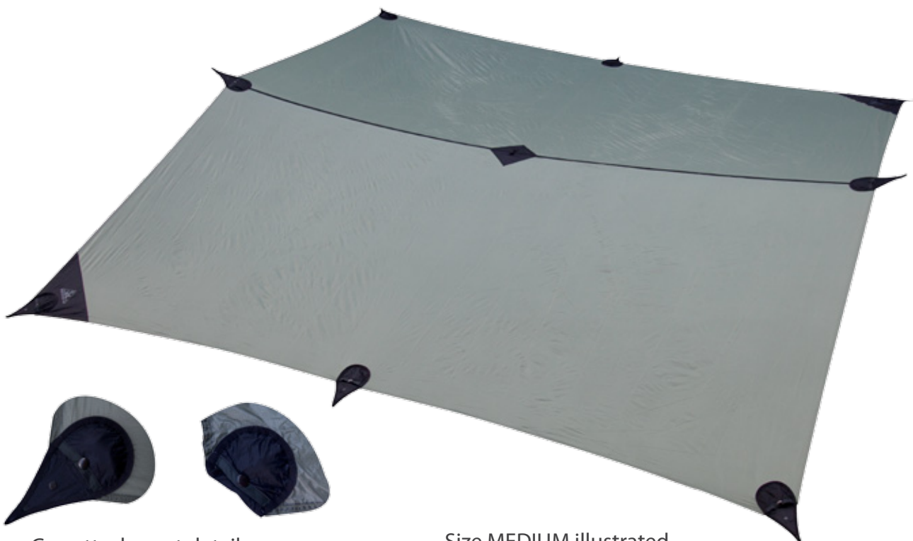
Guy attachment detail